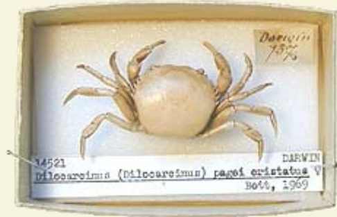
Dilocarcinus (Dilocarcinus) pagei cristatus

This photograph shows specimen 14538, Grapsus grapsus , in its new storage; Darwin's diary entry for this specimen states: August 1834 Valparaiso; crab, above dark "Cochi. R." Legs "Hyacinth & tile R front pincers purplish".