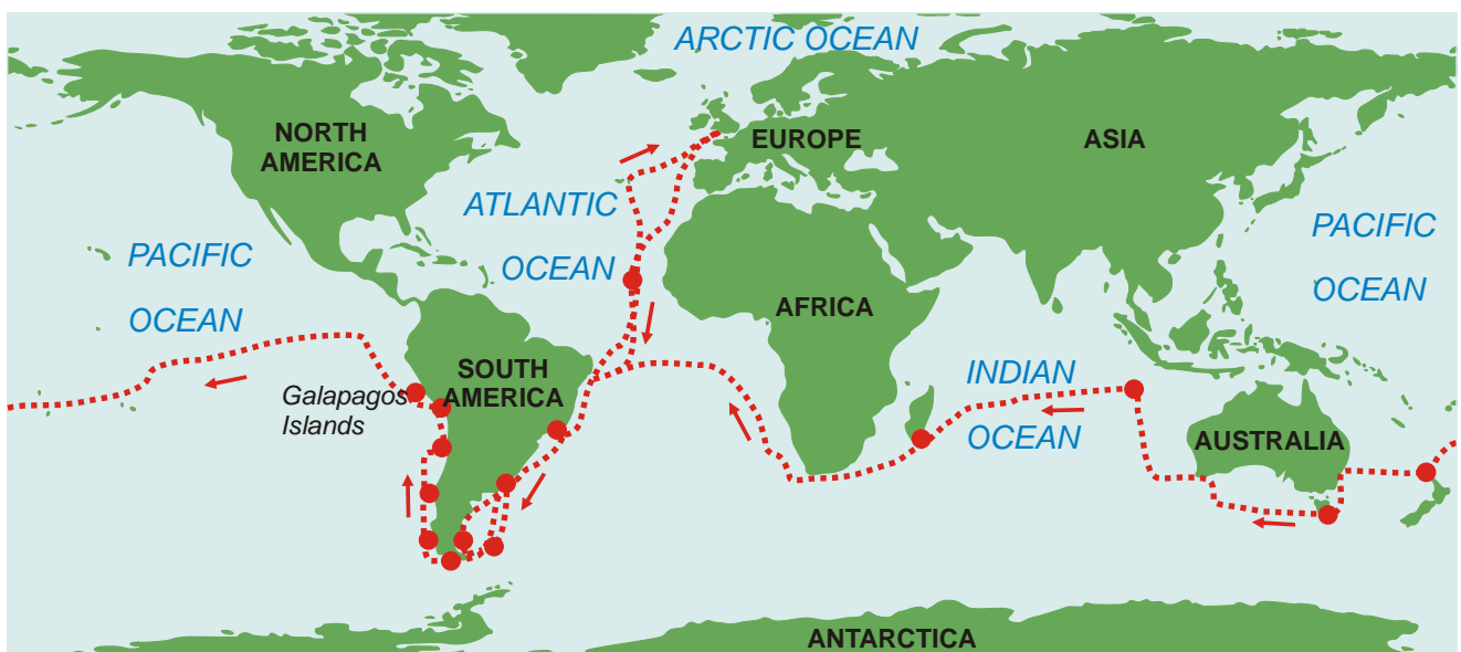
The voyage of The Beagle

Chancellor, G., A. diMauro, R. Ingle & G. King (1988). Charles Darwin's Beagle collections in the Oxford University Museum. Archives of Natural History , 15: 197-231.