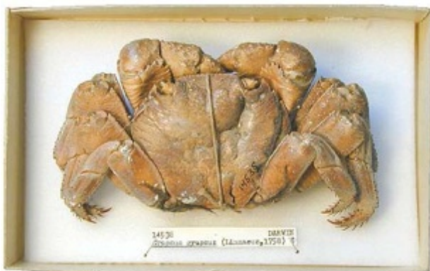
Rehoused and databased

The Museum has electronically catalogued Darwin's collection which is now available as a searchable database. It is fully illustrated and contains Darwin's original diary entries. It is available to browse on the Museum's website, linking from the zoological collections' pages. Further information about Darwin's holdings can be found by contacting the Museum.